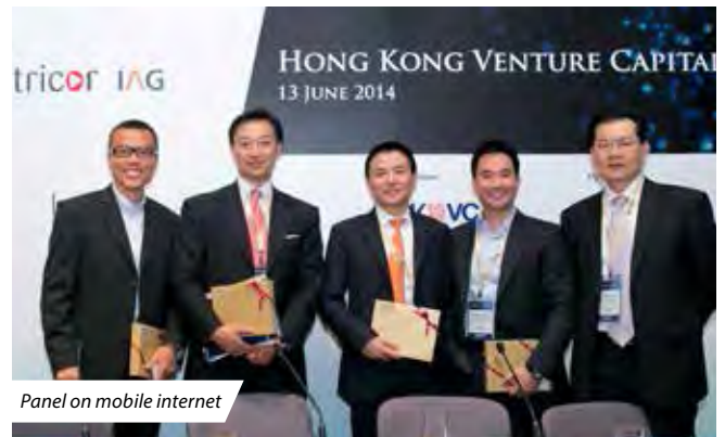
Panel on mobile internet

来自创业投资、非政府组织和私营部门的其他专家在本论坛上探讨了三个主要议题：移动互联网，创业投资在香港的机遇和挑战，以及冲出中国，放眼亚洲的机遇。