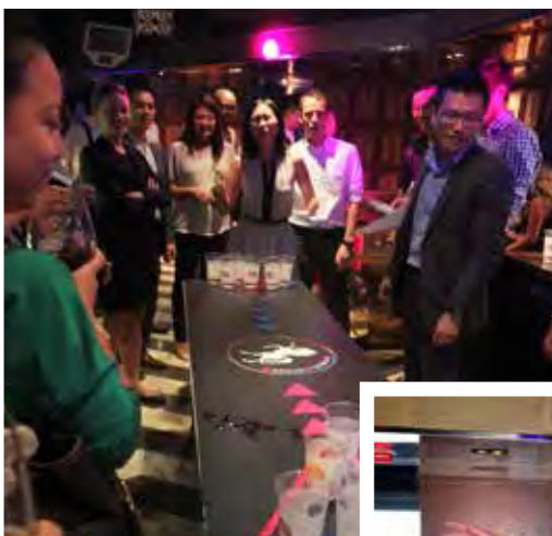
HKVCA 1st Young Professionals Charity Fundraising Beer Pong Competition