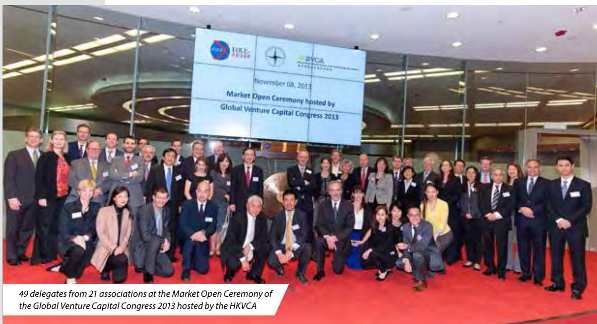
49 delegates from 21 associations at the Market Open Ceremony of the Global Venture Capital Congress 2013 hosted by the HKVCA