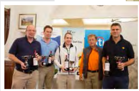
HKVCA 11th Annual Golf Day 2014 at Shek O Golf Club