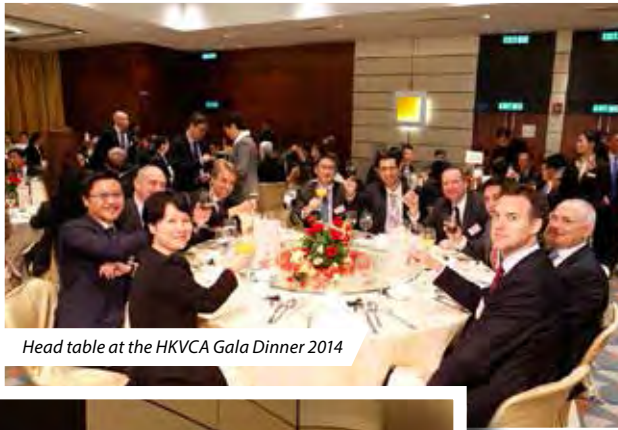
Head table at the HKVCA Gala Dinner 2014