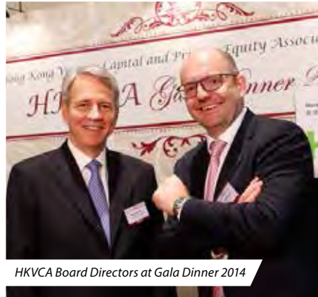
HKVCA Board Directors at Gala Dinner 2014