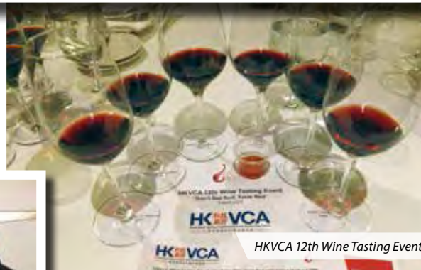
HKVCA 12th Wine Tasting Event