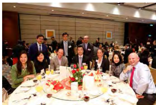
HKVCA Gala Dinner 2014