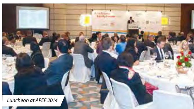
Luncheon at APEF 2014