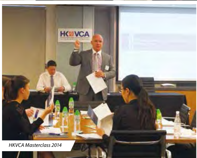
HKVCA Masterclass 2014