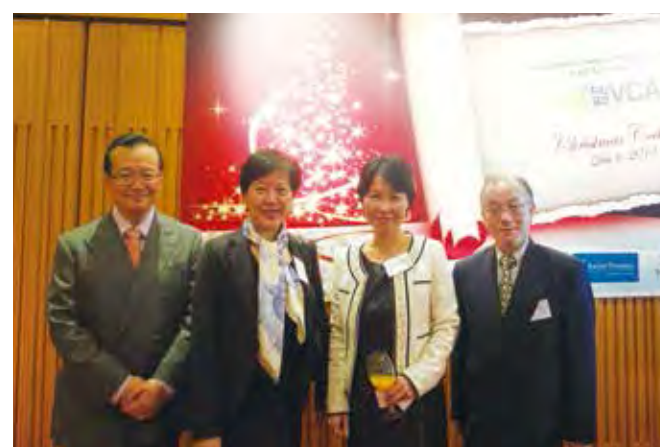
HKVCA Christmas Cocktail 2013 sponsors