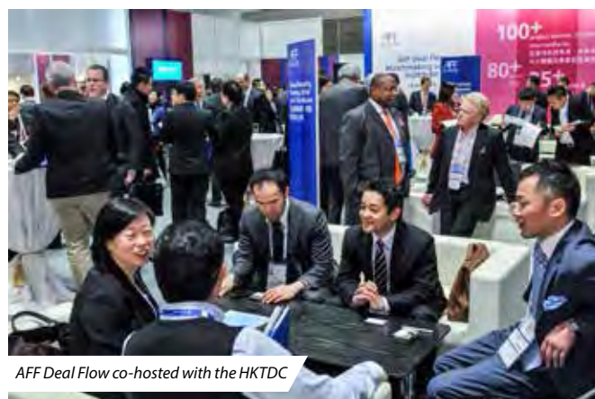
AFF Deal Flow co-hosted with the HKTDC