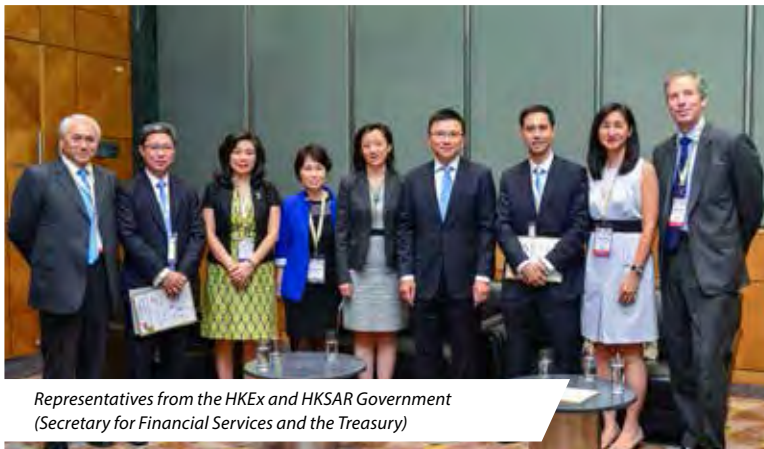
Representatives from the HKEx and HKSAR Government (Secretary for Financial Services and the Treasury)