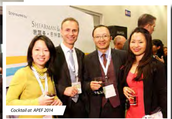
Cocktail at APEF 2014