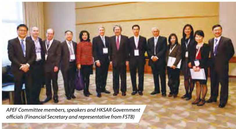
APEF Committee members, speakers and HKSAR Government officials (Financial Secretary and representative from FSTB)