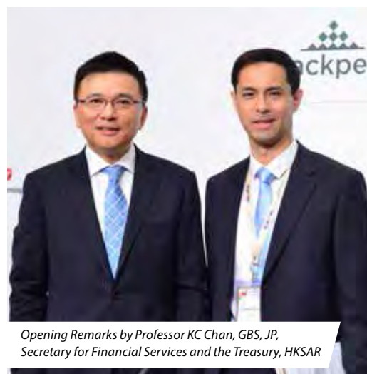
Opening Remarks by Professor KC Chan, GBS, JP, Secretary for Financial Services and the Treasury, HKSAR