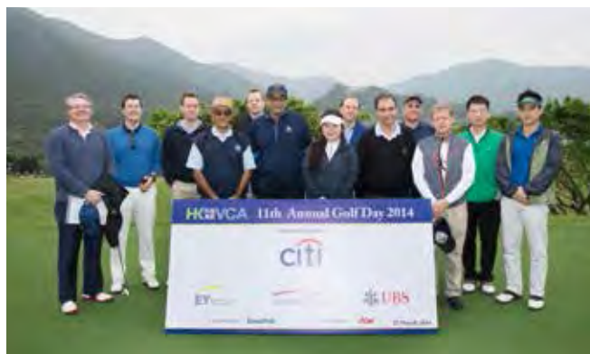
Golf Committee members and event sponsors at the HKVCA 11th Annual Golf Day 2014