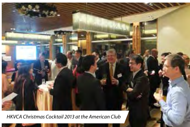
HKVCA Christmas Cocktail 2013 at the American Club