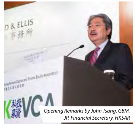
Opening Remarks by John Tsang, GBM, JP, Financial Secretary, HKSAR