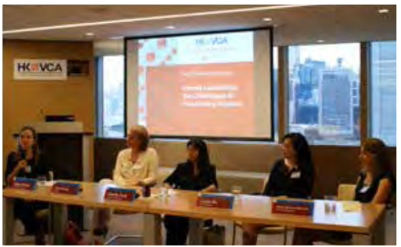
HKVCA Brownbag Luncheon: "Female Leadership - Key Challenges in the Fundraising Process"