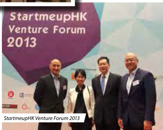
StartmeupHK Venture Forum 2013