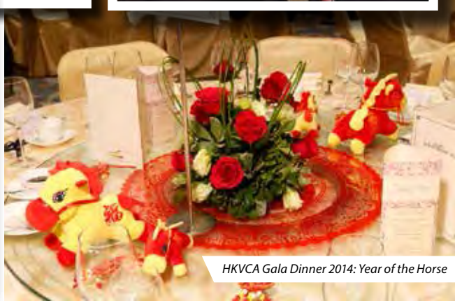
HKVCA Gala Dinner 2014: Year of the Horse