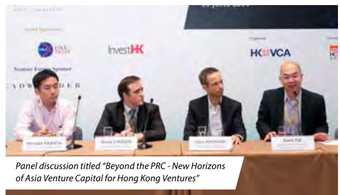
Panel discussion titled "Beyond the PRC - New Horizons of Asia Venture Capital for Hong Kong Ventures"