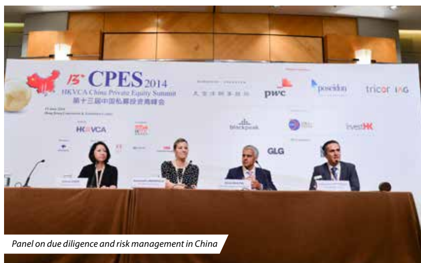
Panel on due diligence and risk management in China