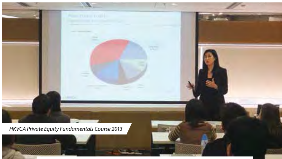
HKVCA Private Equity Fundamentals Course 2013