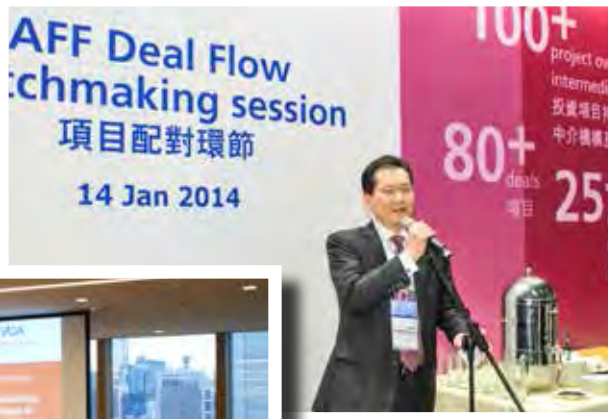
AFF Deal Flow 2014 co-hosted with the HKTDC