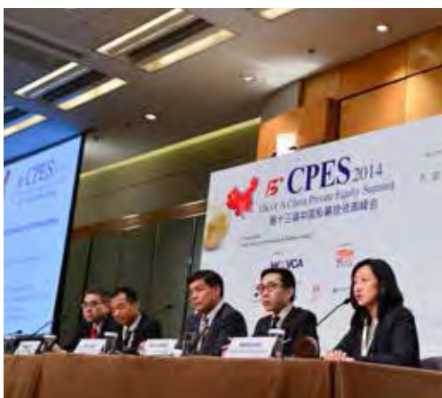
Panel on China private equity from the GP perspective