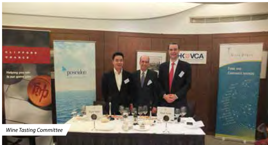
Wine Tasting Committee