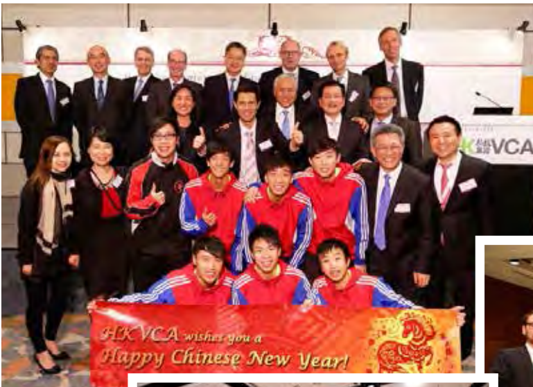
HKVCA directors and performers at the Gala Dinner 2014