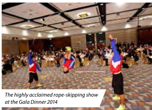
The highly acclaimed rope-skipping show at the Gala Dinner 2014