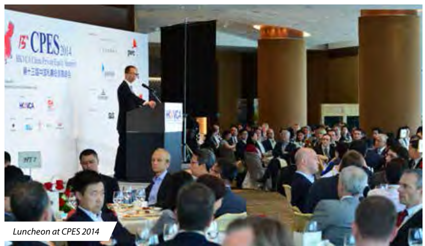
Luncheon at CPES 2014