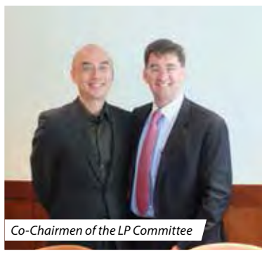
Co-Chairmen of the LP Committee