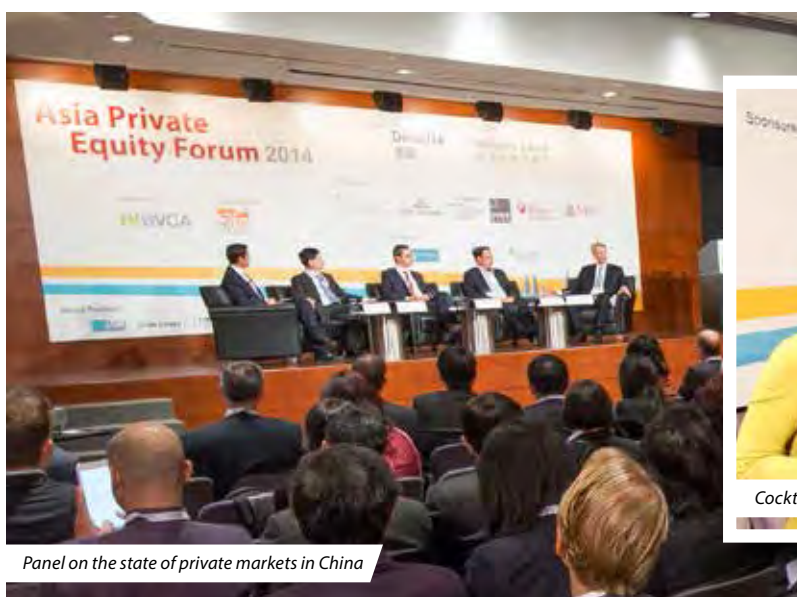
Panel on the state of private markets in China