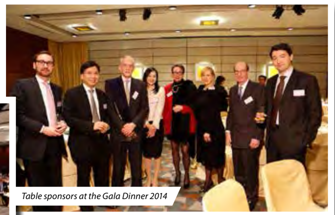
Table sponsors at the Gala Dinner 2014