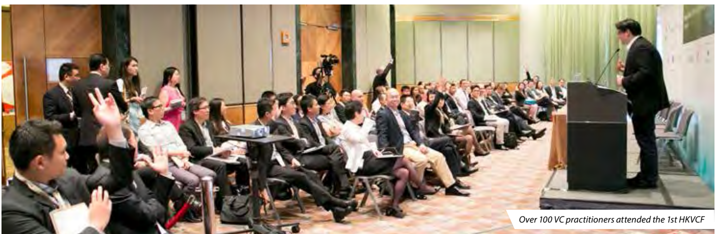
Over 100 VC practitioners attended the 1st HKVCF