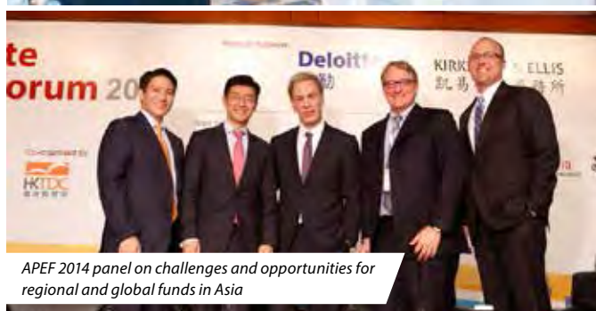
APEF 2014 panel on challenges and opportunities for regional and global funds in Asia