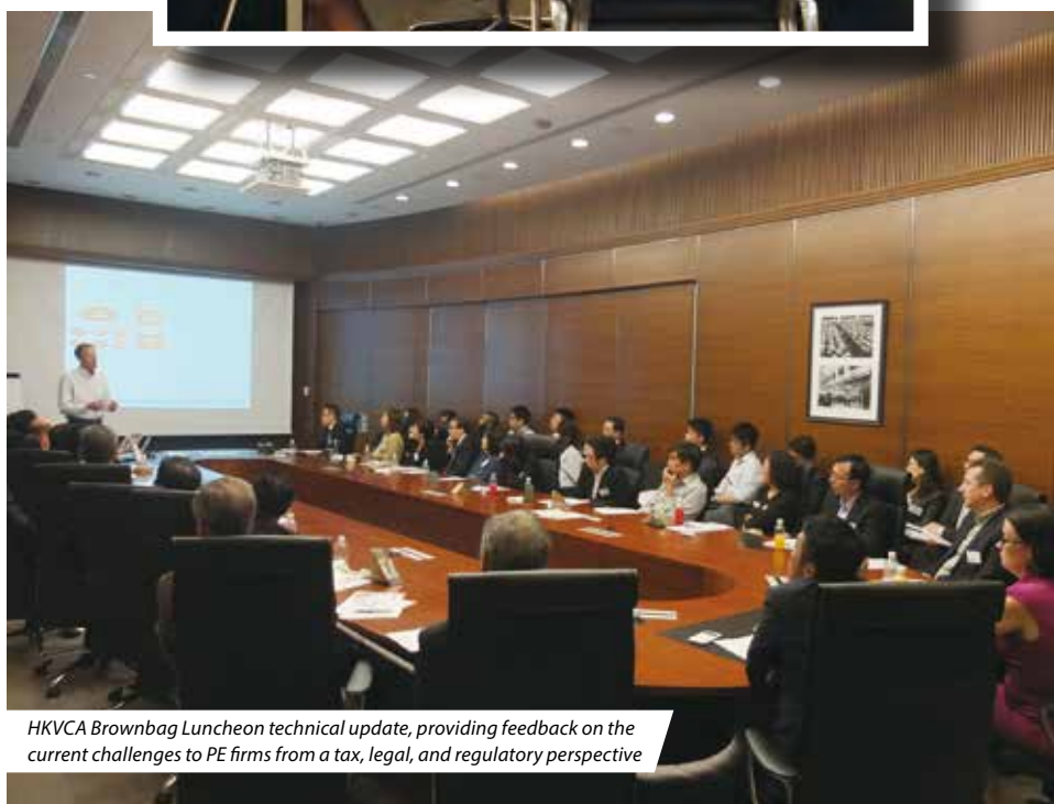
HKVCA Brownbag Luncheon technical update, providing feedback on the current challenges to PE firms from a tax, legal, and regulatory perspective