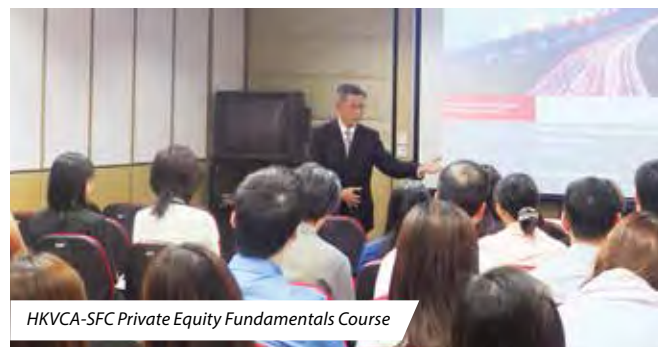
HKVCA-SFC Private Equity Fundamentals Course