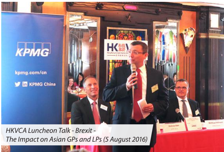
HKVCA Luncheon Talk - Brexit - The Impact on Asian GPs and LPs (5 August 2016)