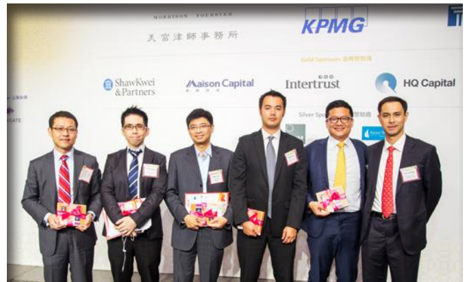
Panelists - Regulatory and Taxation Environment