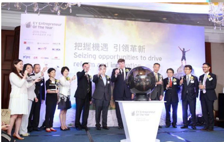
EY Entrepreneur Of the Year 2016 China Program Launch (22 June 2016)