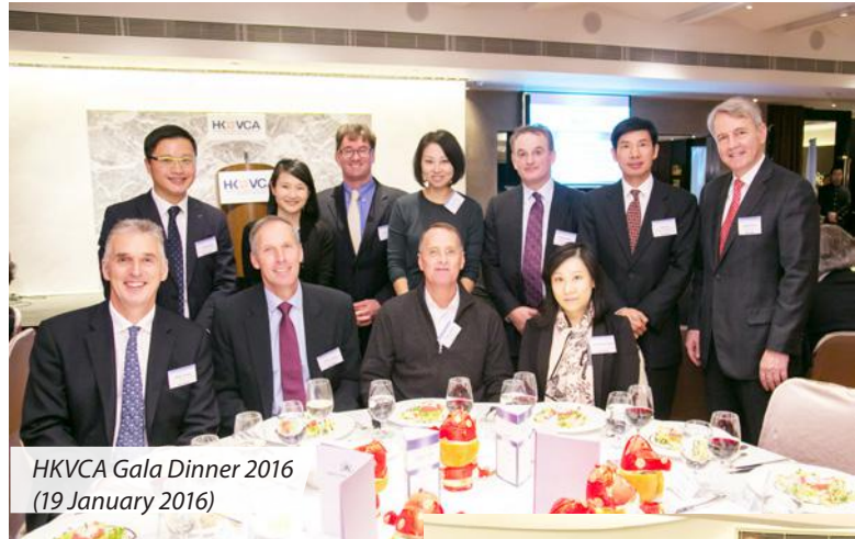
HKVCA Gala Dinner 2016 (19 January 2016)