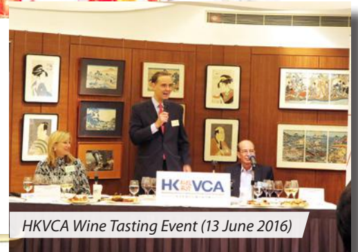
HKVCA Wine Tasting Event (13 June 2016)