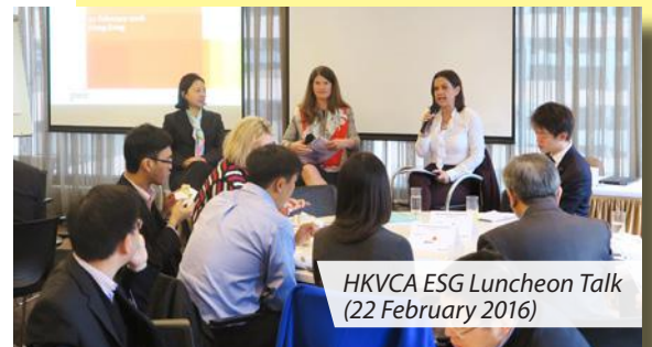
HKVCA ESG Luncheon Talk (22 February 2016)