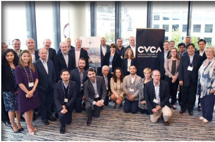
Global Venture Capital Congress in Vancouver (22-23 September 2016)