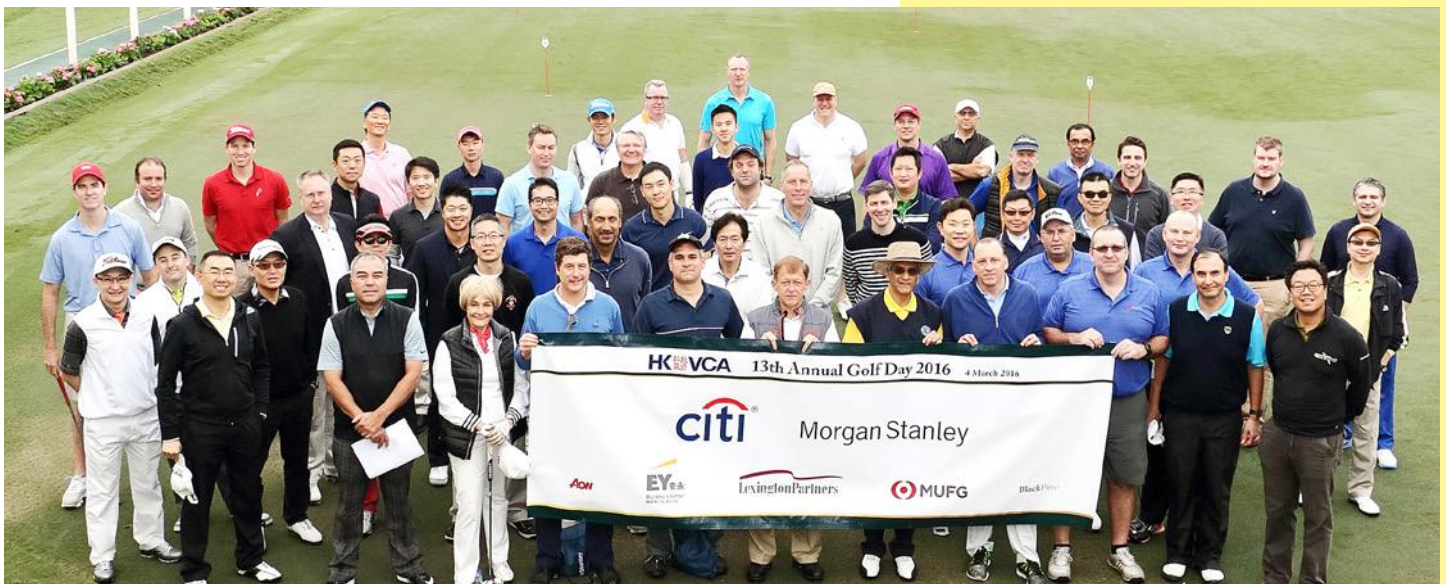
Participants at the 13th Annual HKVCA Golf Day (4 March 2016)