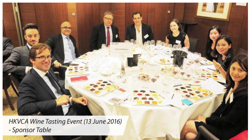
HKVCA Wine Tasting Event (13 June 2016) - Sponsor Table