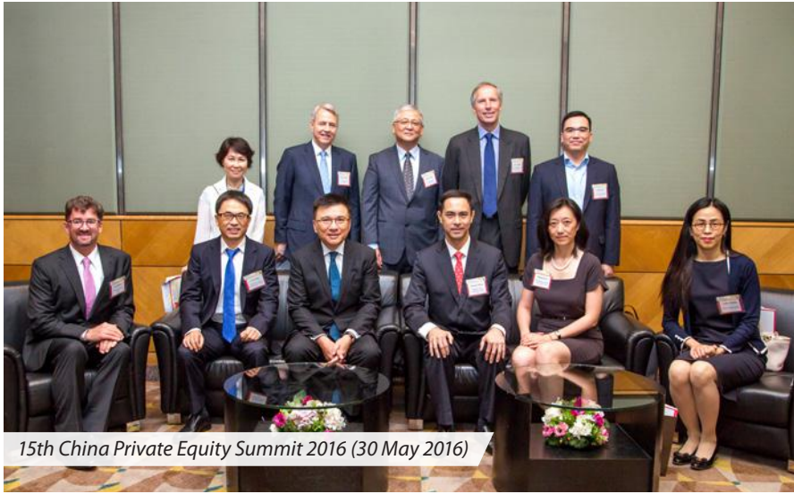
15th China Private Equity Summit 2016 (30 May 2016)