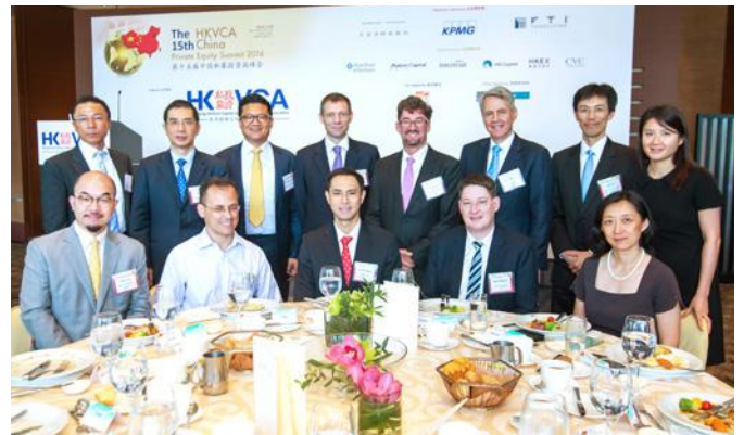
Luncheon Head Table