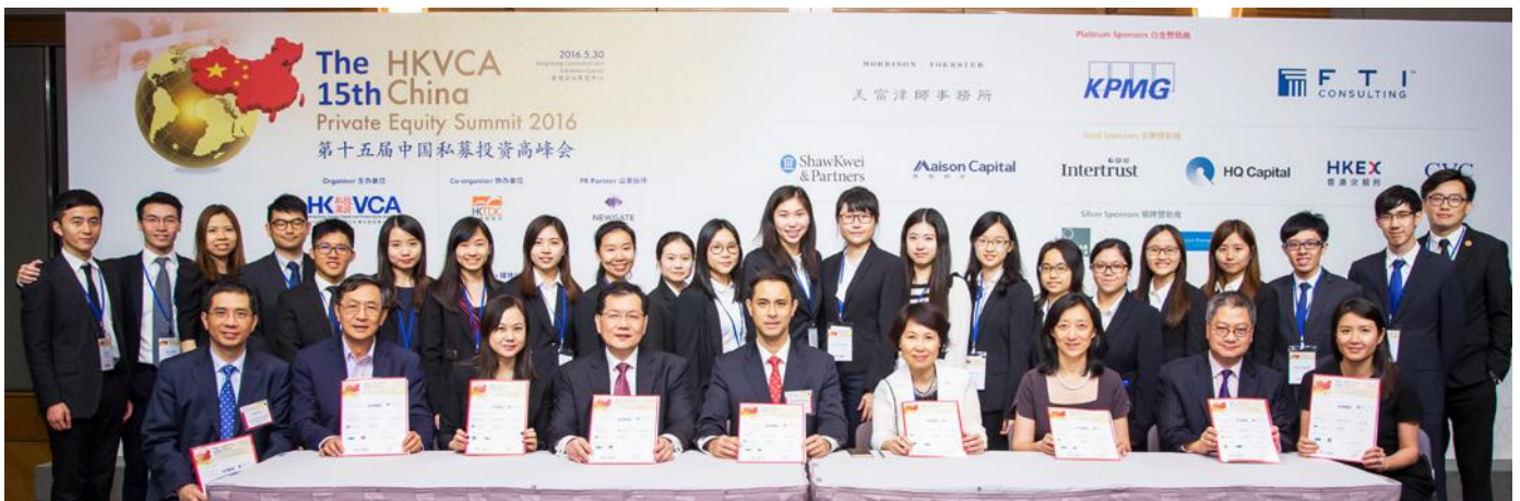
HKVCA PRC Committee and Staff