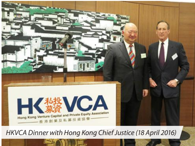
HKVCA Dinner with Hong Kong Chief Justice (18 April 2016)