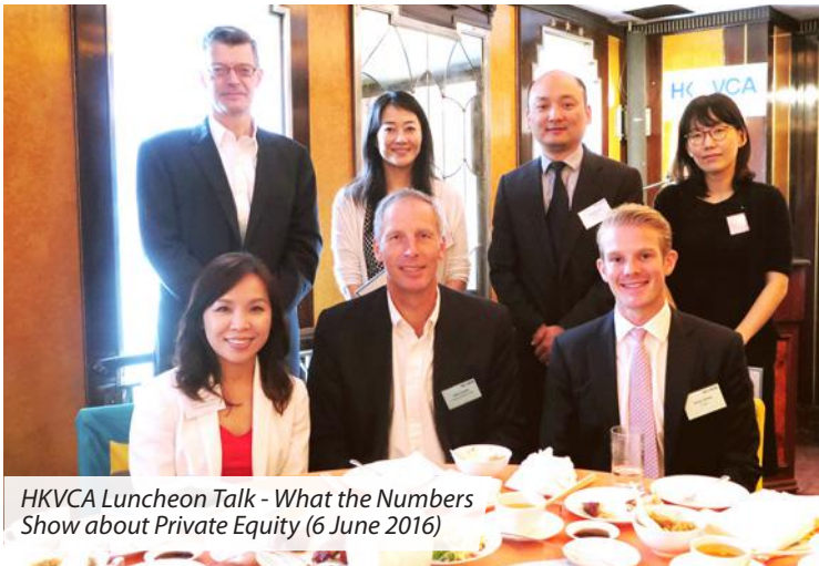
HKVCA Luncheon Talk - What the Numbers Show about Private Equity (6 June 2016)