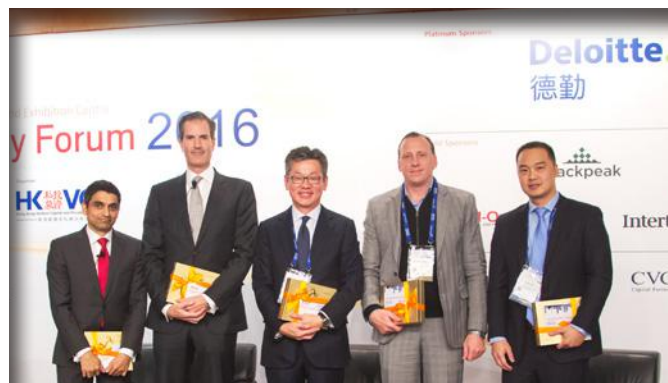
Panelists - Challenges for Asian GPs Raising Funds and Serving Investor Requirements