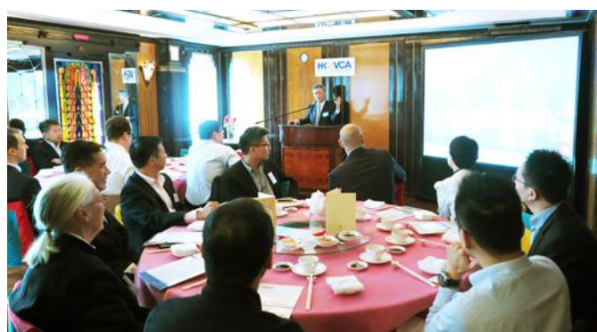
HKVCA Family Office Luncheon (12 October 2015)