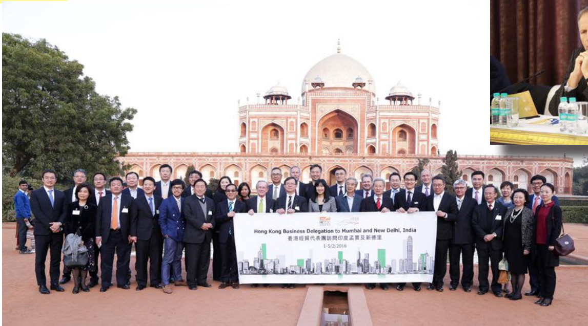
Hong Kong Business Delegation to Mumbai and New Delhi, India (1-5 February 2016)