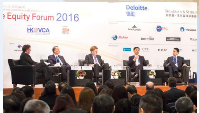
Panelists - How Are Funds with a Regional Mandate Faring in the Current Investment Climate?

会议期间业界领袖在论坛上讨论当前亚洲各国私募市场面临的重要议题。涉及地区包括中国、印度、东南亚各国、日本和韩国，议题内容包括联合投资、基金募集和投资者关系、私募债券、私募地产投资、二级市场基金、价值创造及风险投资。