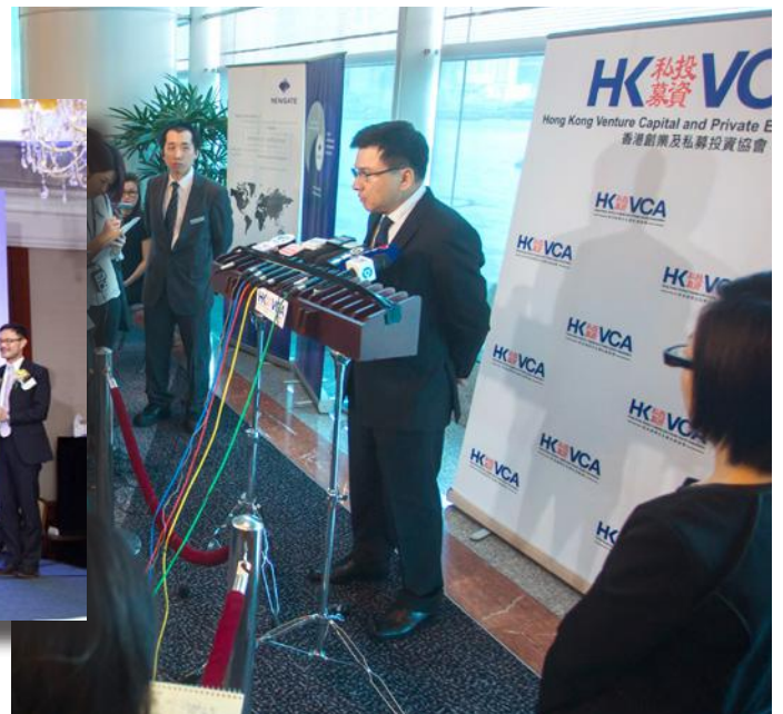
Media Interview with Professor K C Chan, GBS, JP, Secretary for Financial Services and the Treasury, Hong Kong SAR Government at the HKVCA 15th China Private Equity Summit 2016 (30 May 2016)