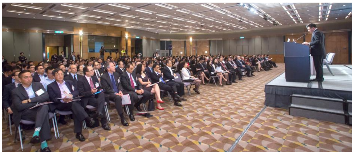
15th China Private Equity Summit 2016 (30 May 2016)