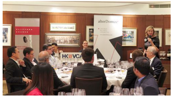
HKVCA Wine Tasting Event (23 November 2015)