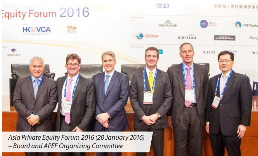
Asia Private Equity Forum 2016 (20 January 2016) – Board and APEF Organizing Committee