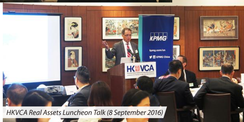
HKVCA Real Assets Luncheon Talk (8 September 2016)