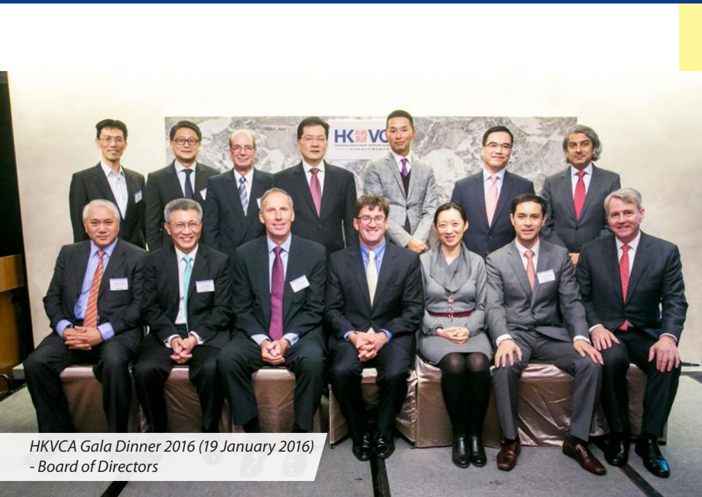
HKVCA Gala Dinner 2016 (19 January 2016) - Board of Directors