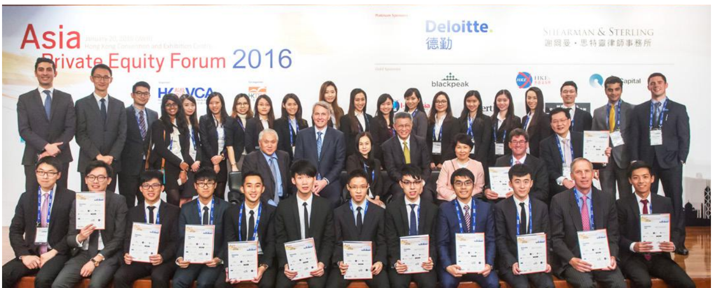
HKVCA Board and Staff