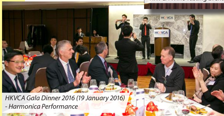
HKVCA Gala Dinner 2016 (19 January 2016) - Harmonica Performance