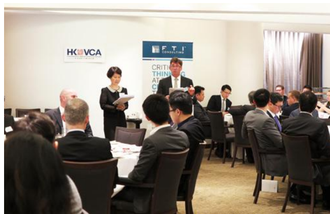
HKVCA Members Breakfast Meeting (8 April 2016)