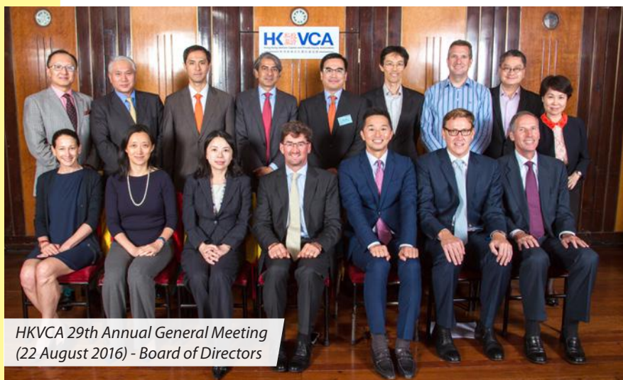
HKVCA 29th Annual General Meeting (22 August 2016) - Board of Directors