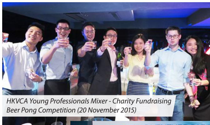
HKVCA Young Professionals Mixer - Charity Fundraising Beer Pong Competition (20 November 2015)