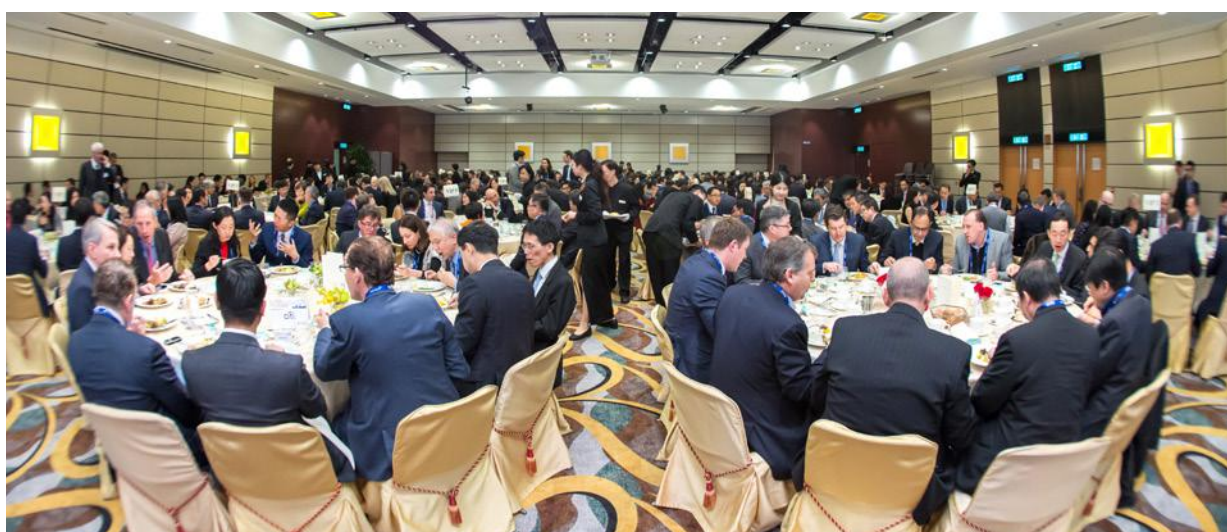
Asia Private Equity Forum 2016 (20 January 2016)