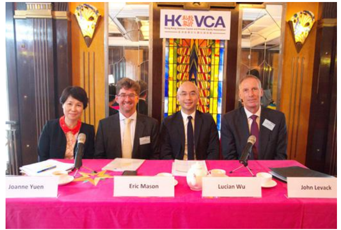
29th HKVCA Annual General Meeting (22 August 2016)