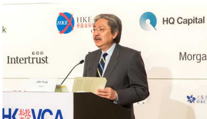
Opening Remarks by John Tsang, GBM, JP, Financial Secretary, HKSAR

During the Forum leading industry practitioners addressed the most relevant issues facing the private equity industry today in Asia's leading private markets, namely China, India, Southeast Asia, Japan and Korea. Topics discussed included co-investments, fundraising and investor relations, private debt, private equity real estate, secondaries, value creation and venture capital.