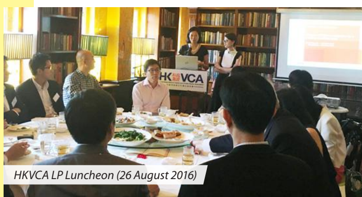
HKVCA LP Luncheon (26 August 2016)