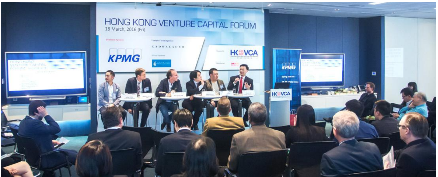
Panelists - Blockchain