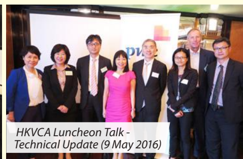
HKVCA Luncheon Talk - Technical Update (9 May 2016)