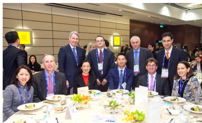
Asia Private Equity Forum 2016 - Luncheon (20 January 2016)