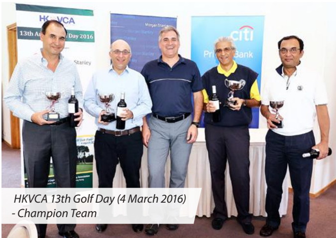
HKVCA 13th Golf Day (4 March 2016) - Champion Team