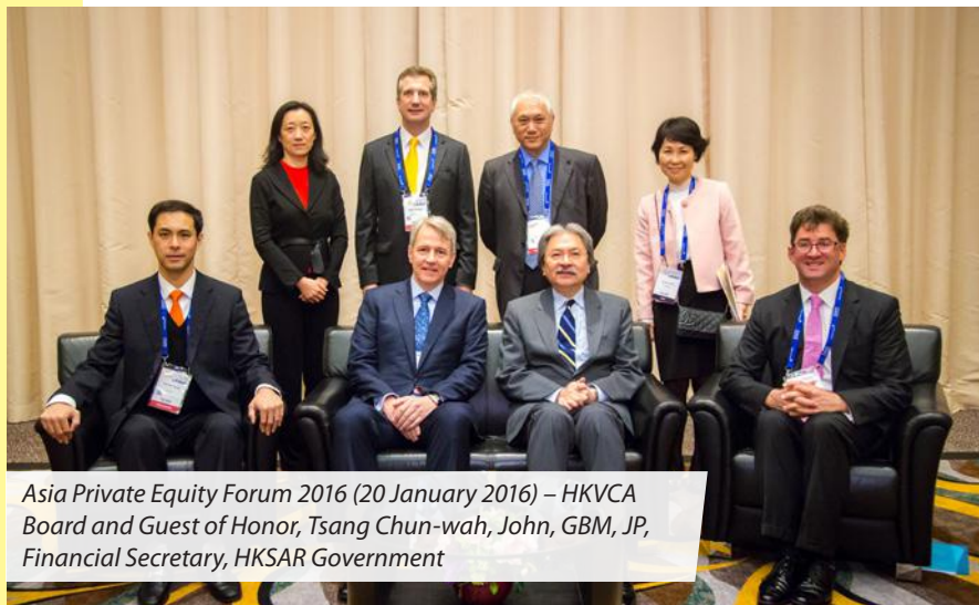
Asia Private Equity Forum 2016 (20 January 2016) – HKVCA Board and Guest of Honor, Tsang Chun-wah, John, GBM, JP, Financial Secretary, HKSAR Government