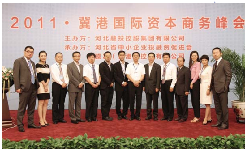
The PRC Committee hosted delegations from mainland China

中国已然成为推动全球经济的主要动力，在过去的二十年间，有相当数量的投资，包括创业及私募投资，通过香港进入中国。我们的会员在中国市场投资会面临各种机遇和挑战，中国委员会一直积极关注和探讨与此密切相关的事务，力图为会员提供协助。中国委员会主要负责每年一次的中国私募投资高峰会(CPES)的组织和策划，以及在北京举办的“私募投资基础课程”的制定和实施。除此之外，今年中国委员会成员亦有幸会晤了多批访港的中国内地代表团，并多次在内地组织和参与举办了行业交流活动。