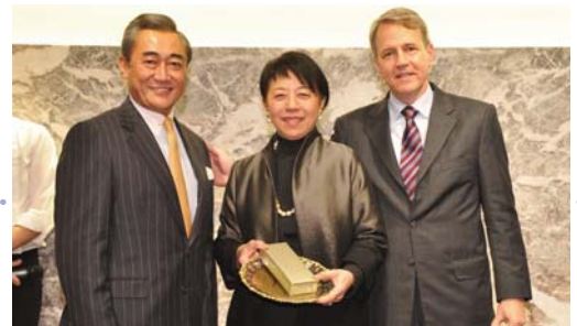
More than 200 members along with guests and colleagues from across the region attended the Dinner