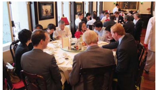
The monthly breakfast event continues to be a popular venue for member networking

除了两场年度会议外，本协会每年亦会组织庆祝晚宴，高尔夫球日，以及美酒之夜等活动。在2012年1月举办的庆祝晚宴有超过200位来自各地区的会员及嘉宾到场共同欢庆，香港乡村俱乐部的主宴会厅一时座无虚席。3月，六十位高尔夫球爱好者参与了在香港石澳举办的「第九届高尔夫球日」活动。前财政司司长及黑石集团主席，梁锦松先生开球并揭开活动序幕。11月，第八届美酒之夜在香港会所举办。来自佳士得(Christies)的谭业明先生再次为六十位美酒爱好者带来了“波尔多之旅”的美妙体验。