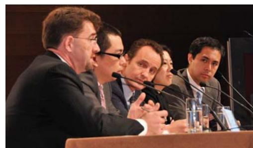
The LP committee is working at helping develop Asian venture capital and private equity performance data

多年来，香港创业及私募投资协会的主体一直是一般合伙人(GP)和专业服务机构。但随着愈来愈多的有限合伙人(LP)活跃于市场中，我们特别成立了有限合伙人委员会，为协会内的有限合伙人提供一个交流平台，让他们就私募股权基金的条款及近况等共同关心的话题自由讨论并交换意见。此外，经有限合伙人委员会的推荐，本协会于2012年与美国康桥咨询公司达成合作意向，为大中华地区投资基金搜集基金业绩信息，提供基准数据。届时，该数据将免费提供给我们的所有会员。