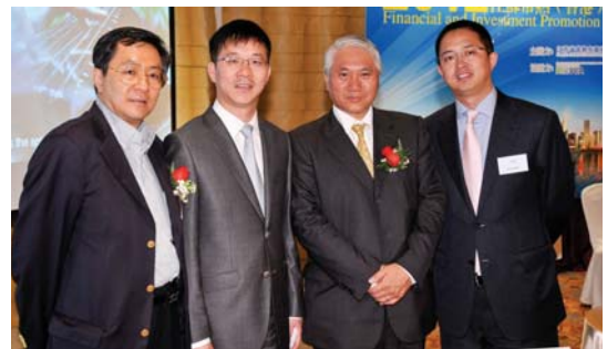
The PRC Committee held events in a number of Chinese cities

China has been a driving force behind the global economy and considerable investment, including venture capital and private equity, has flowed through Hong Kong into China over the last two decades. The PRC Committee actively reviews and discusses issues relevant to members investing in the vibrant and complex Chinese market. In addition to organizing the programme for the HKVCA's annual China Private Equity Summit and the private equity fundamentals course held in Beijing, members of the PRC Committee have during the past year hosted many delegations visiting Hong Kong from mainland China and have organized and held industry events in a number of Chinese cities.