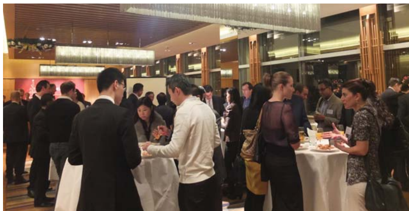
The Cocktail co-organized by the YP Committee

本协会一直积极帮助私募投资行业的青年才俊培养技能，拓宽人脉，因此私募投资青年委员会应运而生。今年，委员会组织了多项活动，包括两个月一次的定期交流酒会，与其他委员会合作举办的鸡尾酒会，以及2012年3月由郭振先生带来的励志演讲等相关活动。