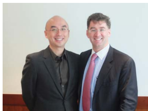
Co-Chairmen of LP Committee

The HKVCA has historically been comprised mainly of general partners and service providers, but in recent years more limited partners have become active and the Limited Partners Committee has been organized to provide them with a forum for discussion of topics of mutual interest, such as terms and conditions of private equity funds. In addition, under the aegis of the Limited Partners Committee, the HKVCA in 2012 entered into an agreement with consulting firm Cambridge Associates to help gather information about fund performance and deliver benchmark data for funds investing in Greater China. This data will be made available to HKVCA members at no cost.