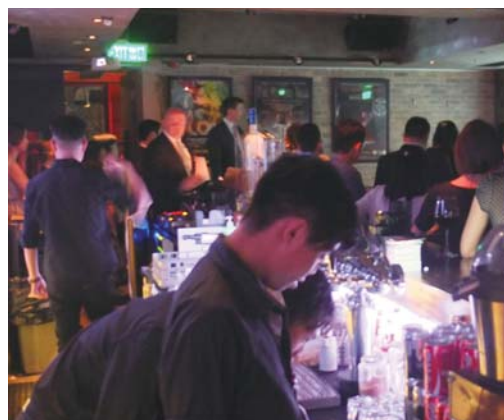
A bi-monthly drinks event is organized by the YP Committee