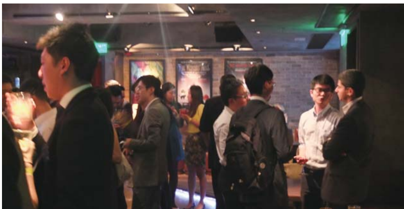
HKVCA is keen to help young professionals develop their skills and contacts