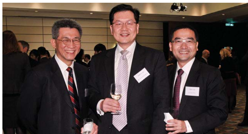
The Venture Committee works to support entrepreneurs as the building blocks of the economy