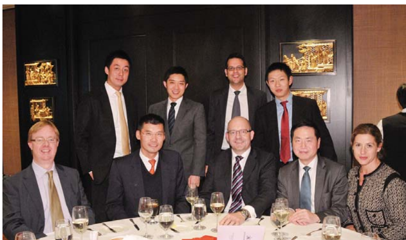
The Gala Dinner provided the opportunity to play host to a number of associates from other venture capital and private equity associations