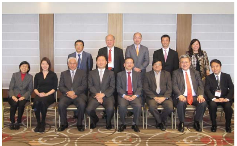
AVCPEC creates an Asia-wide identity for the venture capital private equity industry

2012年1月在香港举行的圆桌会议中，日本创业投资协会(JVCA)被选为首位协会主席，同时，香港创业及私募投资协会(HKVCA)被委任为首任协会秘书。