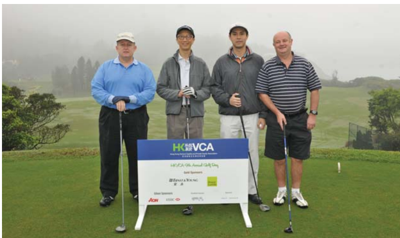
Antony Leung, former Financial Secretary and Chairman of Blackstone, was first to tee off

THE SOCIAL COMMITTEE WAS INVOLVED IN HOSTING A NUMBER OF KEY EVENTS, INCLUDING THE ANNUAL GALA DINNER, THE 9TH ANNUAL GOLF DAY, WINE TASTING AND THE MONTHLY BREAKFAST EVENT