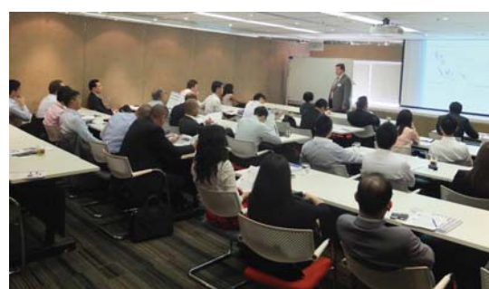
Members appreciated the more technical master classes

In addition to fundamentals, the Education Committee actively sought to help members with professional development in specific areas of interest. A number of more technical master classes and luncheon talks were organized during the year, addressing such topics as valuation methodologies under various international accounting standards, advanced financial modelling, taxation and venture capital investment structuring. These events have proven very popular and were always very well attended, drawing about 50-60 participants each month.