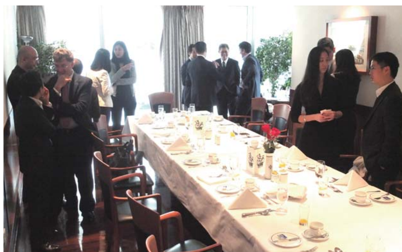
LP Committee provides limited partners with a forum for discussion of topics of mutual interest