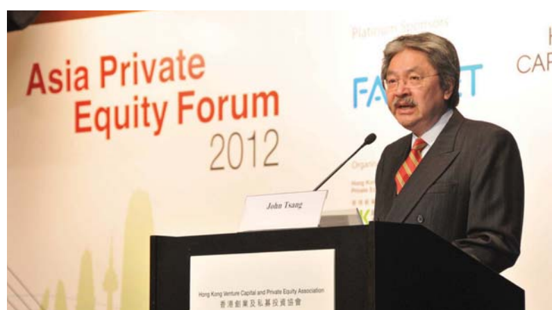
Financial Secretary of HKSAR, Mr John Tsang GBM, JP, addressing the Asia Private Equity Forum 2012

The HKVCA now organizes two major conferences, the Asia Private Equity Forum and the China Private Equity Summit, in January and June each year.