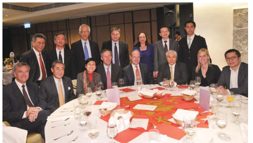
AVCPEC recognizes the importance of cooperating to encourage the industry's growth across the region