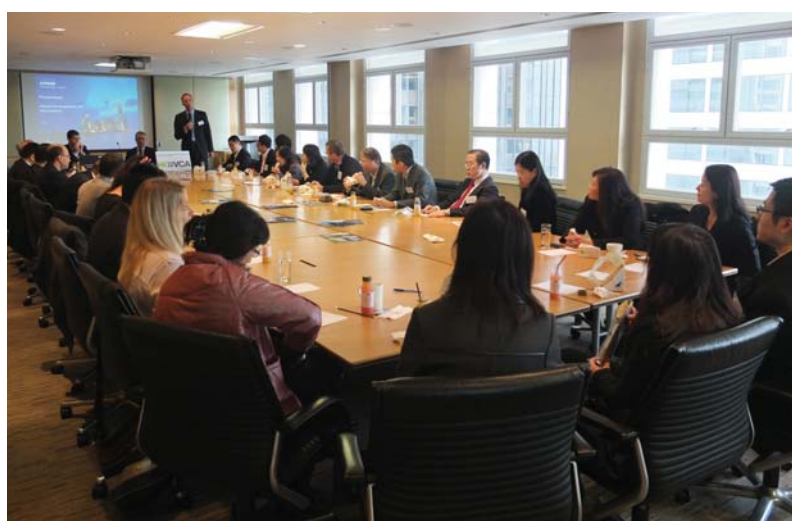
A Luncheon Talk organized by Education Committee

除了私募投资基础课程外，教育委员会还致力于为会员在专业领域的深入发展提供帮助。为此，我们在年内组织了一系列午餐会及进阶专业类课程。这些活动旨在探讨诸如多重会计准则下的估值方法，高级财务模型，税务，以及风险投资架构等议题，每月吸引五六十位参与者，得到成员的热烈欢迎并广受好评。