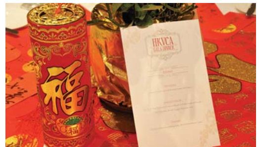
The return of the popular Gala Dinner as an annual event was welcomed by members