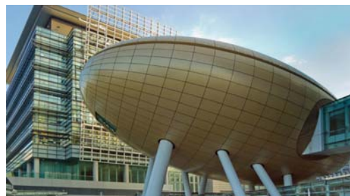
The Venture Committee worked with the HKSTP

创基委员会同时积极协助香港科技园开展科技创业培育计划与香港天使投资项目讨论会的招募工作。我们也共同组织了香港创投及天使投资会议与2011创新科技亚洲会议-投资工作室与项目配对活动。此外，创基委员会今年在为私募投资基础课程打造了全新的创业投资模块的同时，也在2012年中国私募投资高峰会中添加了新元素，设立了新环节“创业投资在中国-对话腾讯”。